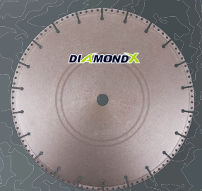
Normal Core & Silent Core Noise Comparison Test